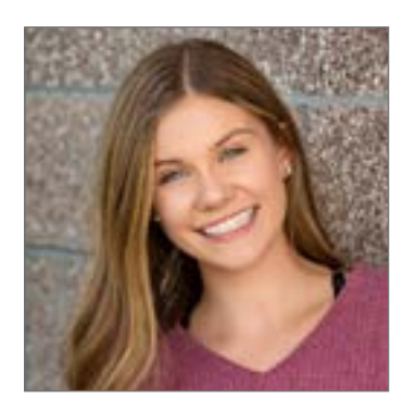
Video clip: <a href="https://youtube.com/shorts/">https://youtube.com/shorts/</a> <a href="CwquD-xaHdc">CwquD-xaHdc</a>