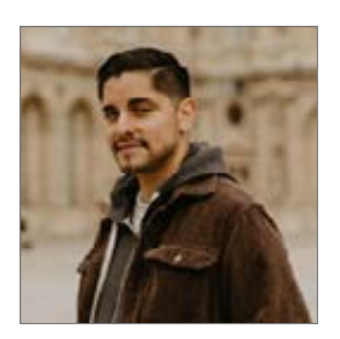
Video clip: <a href="https://youtu.be/t28DvAnXwZc">https://youtu.be/t28DvAnXwZc</a>