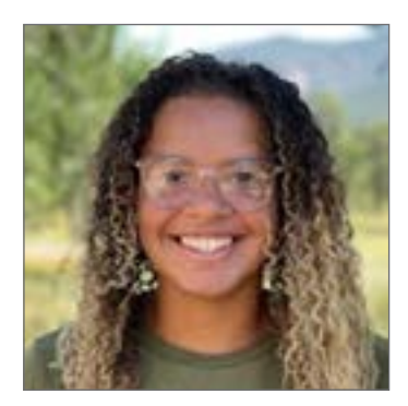
Video clip: <a href="https://youtu.be/wJyA_be9K7U">https://youtu.be/wJyA_be9K7U</a>