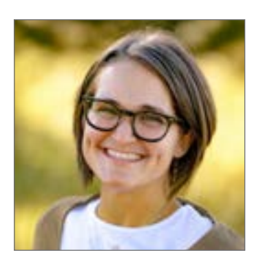
Video clip: <a href="https://youtu.">https://youtu.</a> be/ b45IIO64TM