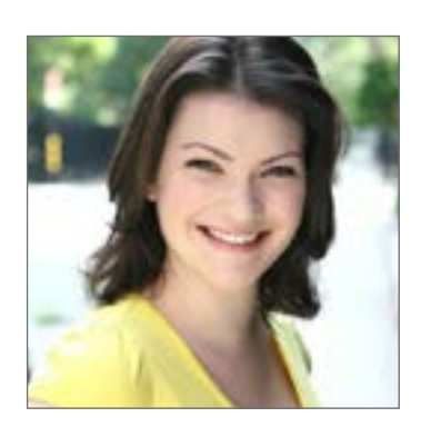
Video clip: <a href="https://youtu.be/wSVM1zgFH">https://youtu.be/wSVM1zgFH</a> s