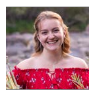
Video clip: <a href="https://youtu.">https://youtu.</a> be/IFcgxt7DBUM