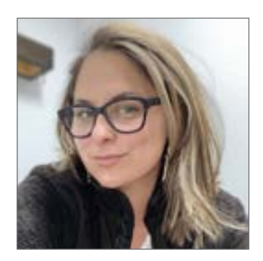
Video clip: <a href="https://youtu.be/ilLiCzybP5o">https://youtu.be/ilLiCzybP5o</a>