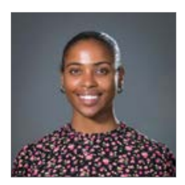
Video clip: <a href="https://youtu.be/2lmm">https://youtu.be/2lmm</a> R-T6pU