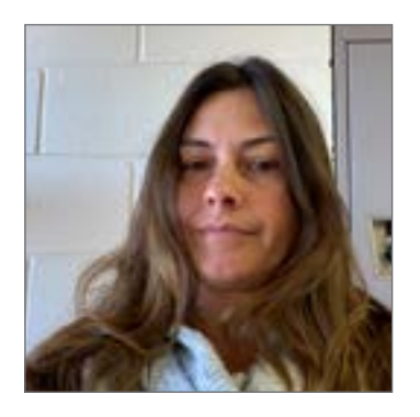
Video clip: <a href="https://youtube.com/shorts/">https://youtube.com/shorts/</a> BY UICwWb0w