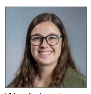
Video clip: <a href="https://youtu.be/DVmkUs1xEDg">https://youtu.be/DVmkUs1xEDg</a>